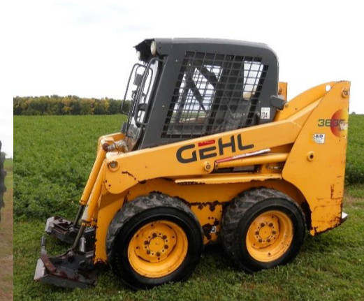
2014 CIH Farmall 95 MFWD , Dual Door Cab, 18.4R-34 & 13.6R 24- 2 shafts, only 670 hrs. Cows sold, tractor left over from lease to own. A low-houred like-new tractor without the dealer lot price. Great Gehl 3635SX Skidsteer , Yanmar Dsl. powered, cab w/wheat, aux. hyd., T-bar, standard Universal attach., rear counter bumper w/pin hitch. Never in manure, nice original paint & only 1883 hrs. Selling alongside—4 new tires & chains.