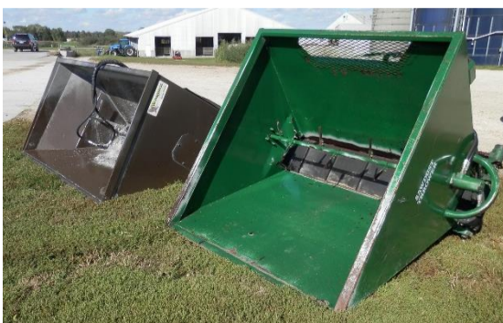
Patz belt conveyor ; Ueblor 812 Honda gas powered feed cart, RH unload—nice; Approx. 1000 sidewall tire bunker covers; 2-Delaval Power Cattle Brushes in good running order & just out of use. BPI Portable Hoof Chute w/under floor pallet fork tubes & rear removable entrance gates—complete & good! Like Brand New Herd Pro Catch Chute , rear vertical drop gate w/front controls—not broke in yet! Lots & lots of gates removed & ready to load, several brands & many lengths ranging from 8' to 16' Portable Calf Cart —like brand new. Custom built HD portable loading chute , pin hitch, all steel, adj. stands. Excellent! Big Assortment of QT & Other Attachments...Artex 1512SM QT Bedding Shooter , L or RH—nice original paint; Becker Woodchuck 80 HTL Bedding Shooter QT Skid 6' rotary mower —works on low flow machines. QT Skid round bale clamp —VG! Fritsch Equipment 6' QT Facer —in use right up to the auction—good. Tire Gator 160 bunker cover tire shooter, pallet fork quick mount, hyd. drive—great w/Telehandler. HD 3 pt. or Ldr. Mt. bale spear (or add weld-on QT plate) 10' HD Big Sno-push blade , hyd. angle, bolt on edge & adj. pitch. 3-pt. Bunker plastic unroller , 94" cap. width, adj. stands-VG Plus... buckets, pallet forks, & more. Misc. Cattle Related... Poly water tanks; poly feed cart; and more typical cow care items. Straw —Big Bales clean straw. Quality haylage & corn silage piles sell...feed tests available. See terms on opposite side.