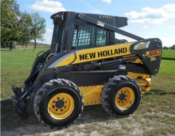
NH L180 Skidsteer w/cab, QT, 2-spd., Aux. Hyd., Nice (80%) rubber, rear weight brackets, 35 th Anniversary Model.