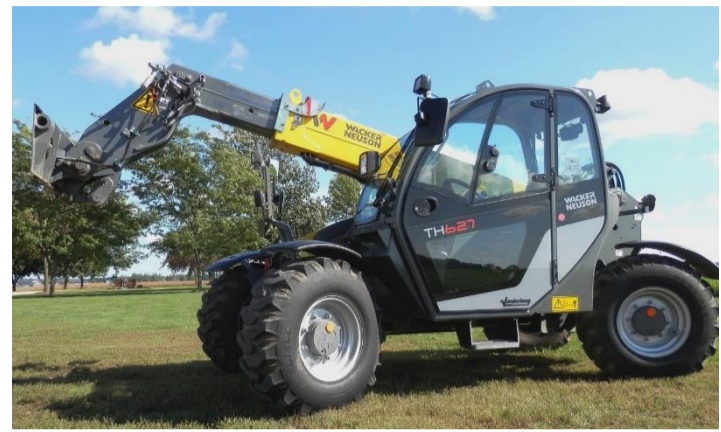
Late Mdl. Wacker Neuson TH627 Telehandler , 4x4, Big Cab, All Wheel Steer, Standard QT Bucket System, Aux. Hyd., 90" Material Bucket, has Grammar Seat & is Kohler Dsl. Powered. Only 1553 Hrs. on this well built HD compact unit.