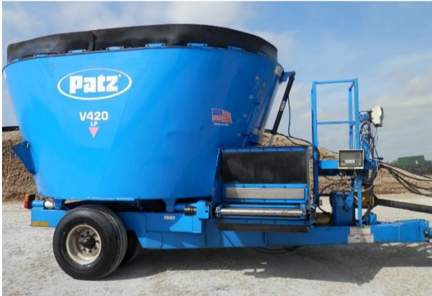
Host Farms Patz V420LP Vertical Portable TMR Mixer , 4-wheel transport, rubber spill ring, LH or RH cross chain front discharge w/magnet, 2 digital scale read-out hds. located for front & side scale read. Well Maintained & Shredded! Roto Grind Portable Rotary Tub bale grinder w/LH blower discharge and hyd. control cap, Hyd. Spd. Control Tub. Grinder has nice original paint inside & out!