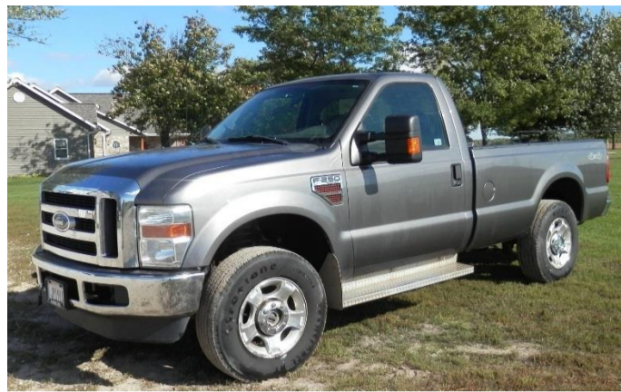
Micke Dairy-- 2010 Ford F250 XLT Super Duty V8-power stroke, 4x4, standard cab, 8' box w/5 th wheel, bucket seats—clean farm truck w/123K miles.