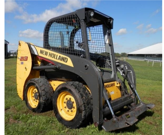
NH L213 Skidsteer , QT, 3 outlet aux., good maintenance—5000 hrs. include many as daily multi feed push-up use.