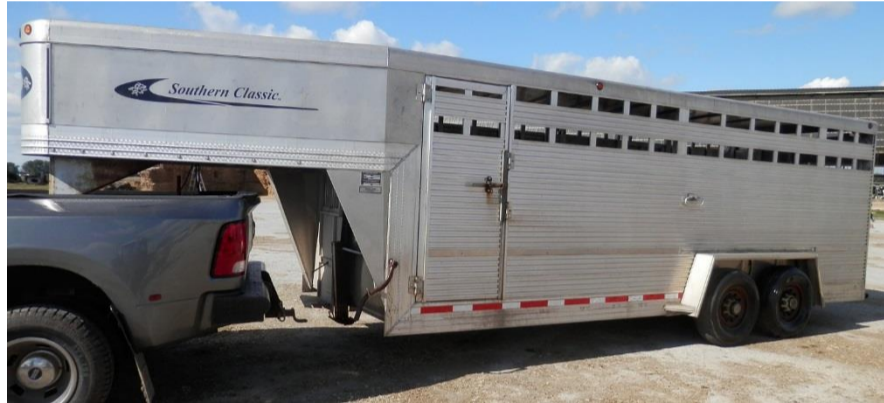
Southern Classic Mdl. LGN76620 20' x 6 1/2' Alum. GN Stock Trailer, 14K tandem axle, 8-bolt hubs, center splitter w/roller door, front fold up vents & removable lower vent strips.