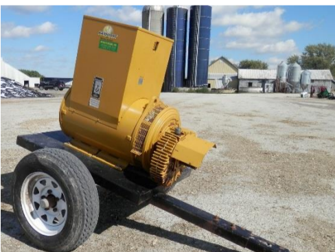
Katolight KLML-75-1000 portable generator, factory cart, single phase, 75 KW. The Mickes kept it shedded & covered. Excellent!