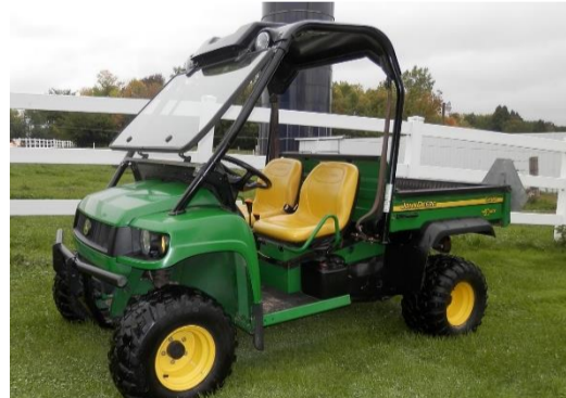
Sweet...JD HPX Gator , 4x4 ROPS w/canopy, hinged front bottom flip out glass windshield and additional lights. Gator has manual dump box w/liner. Adult driven, excellent care & paint—only 543 hrs. Held back until after sale of farm—Ziemer Estate.