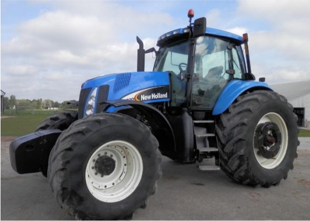
NH TG230 MFWD Tractor , PS, Supersteer, Companion Seat in clean cab, 710/70R42's (75%), 600/70R 30's w/fenders, rear pair 227 kg outer weights, full rack 16 suitcase up front, Quad Remotes, Fold-away Flashers, very nice paint & only 3754 hrs. SN 12947. A nice clean low-houred Micke tractor.

Selling on the neat & tidy Micke Dairy —A great group selection in one location. All five main farms represented are estates, have sold the farm, and or discontinued dairy farming recently. Great Hosts, quality selection and site with sale held on the Mickes huge concrete feed pad—kind of a “Mini Fall Round-Up”